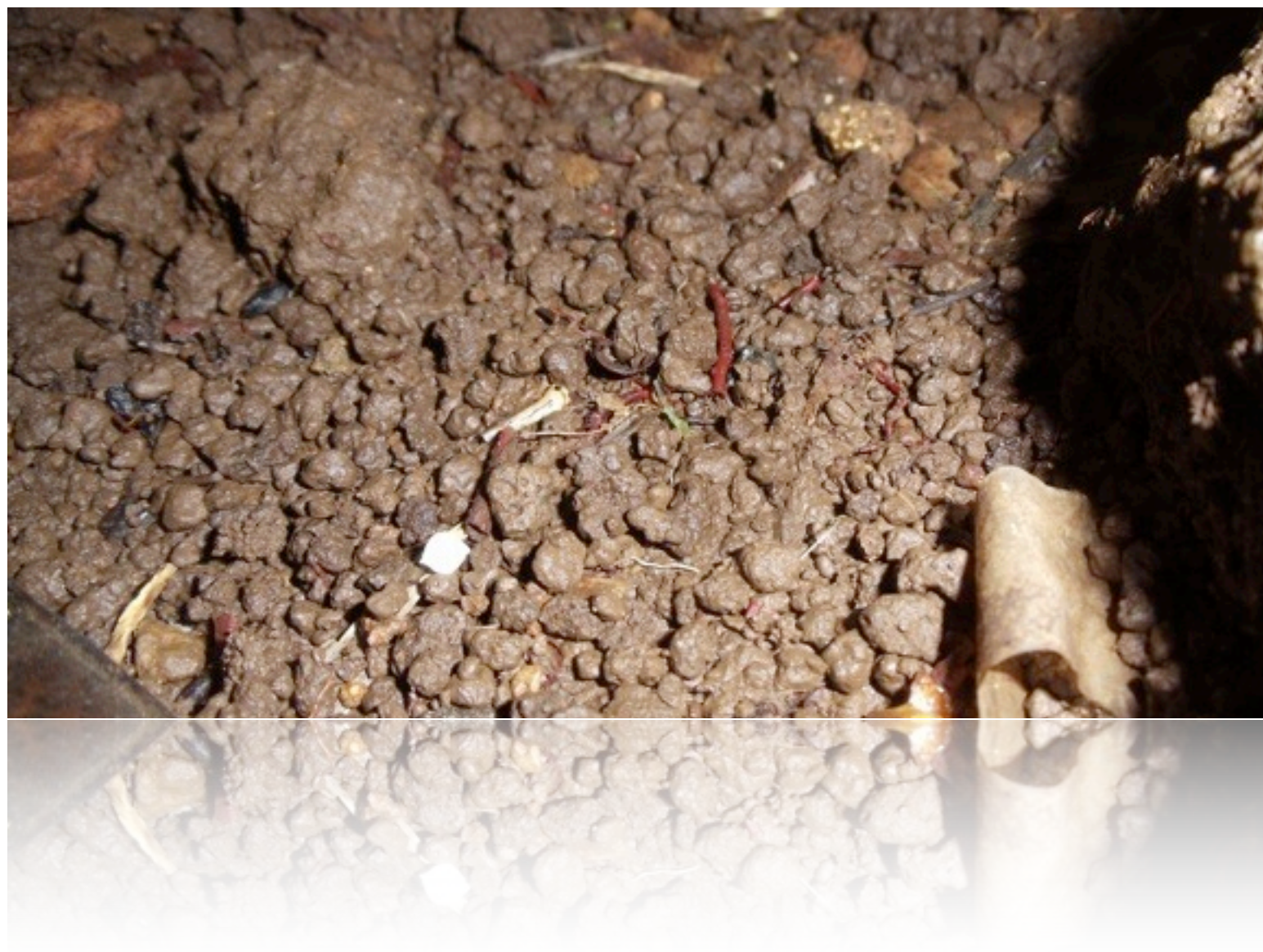
Close up of soil under 'ulu