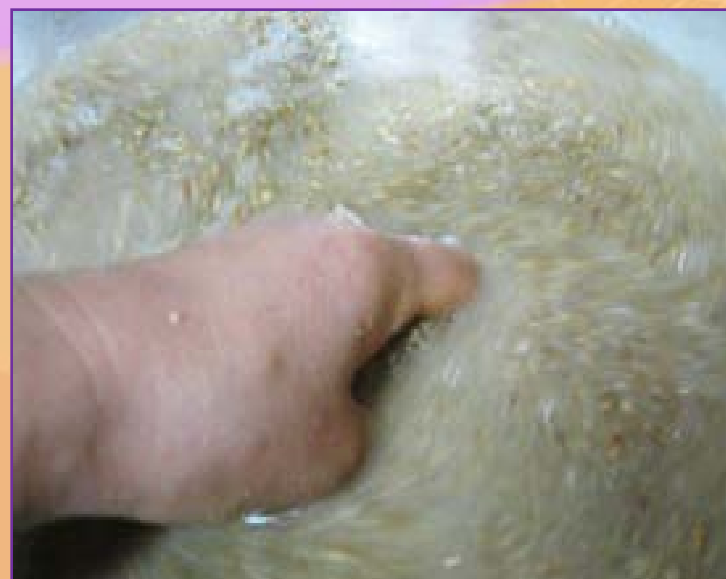
② Pour water, then rub and soak the malt.