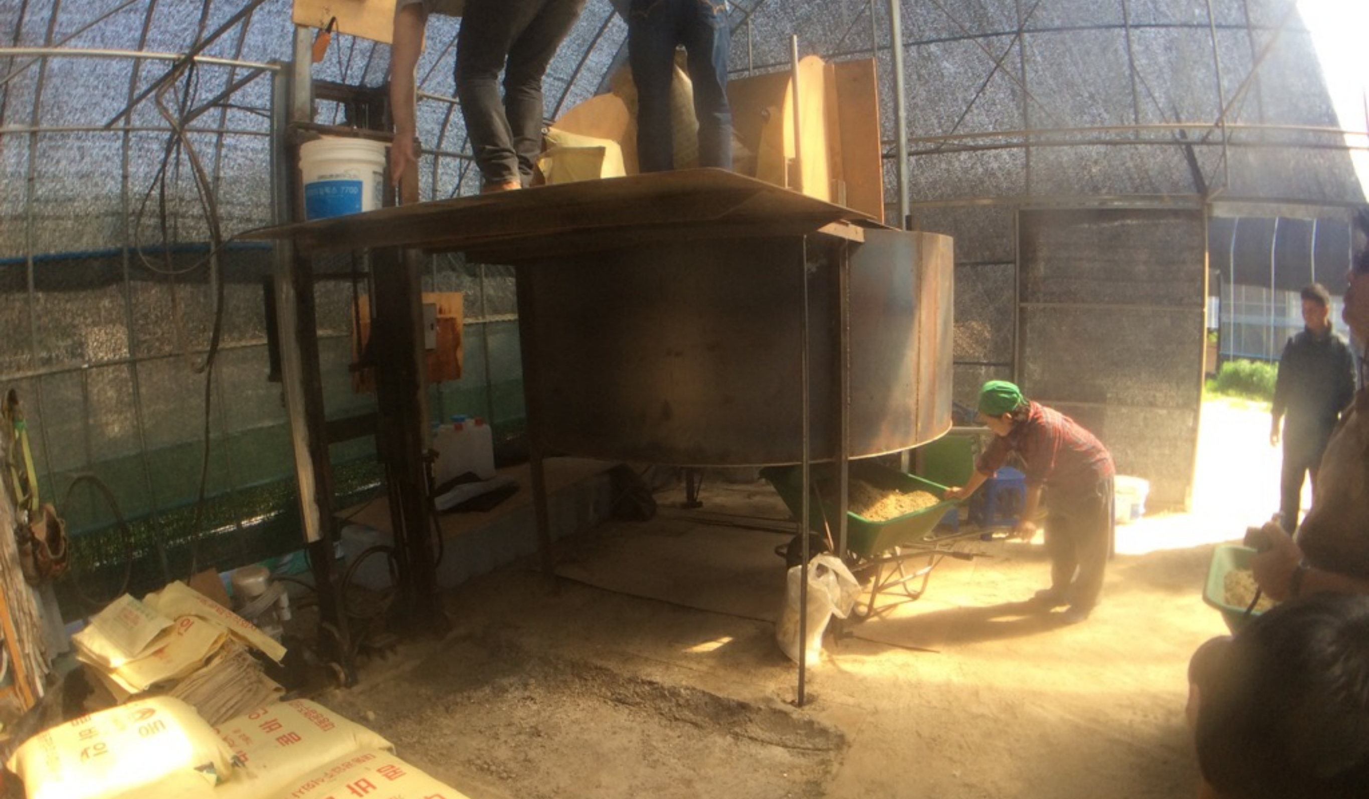
feed mixer for making layer food